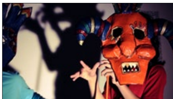
The Acfields - Grabbed Me By The Heart music video