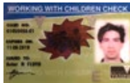
Working with Children