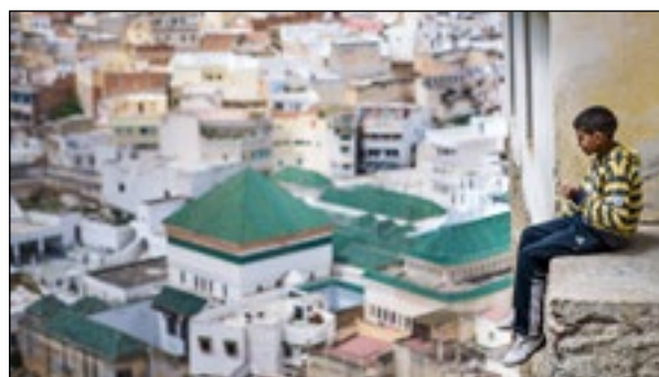
Travel photo portfolio